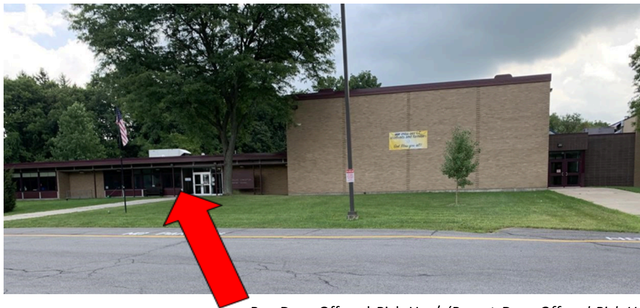
Bus Drop Off and Pick Up / (Parent Drop Off and Pick Up During School Hours)