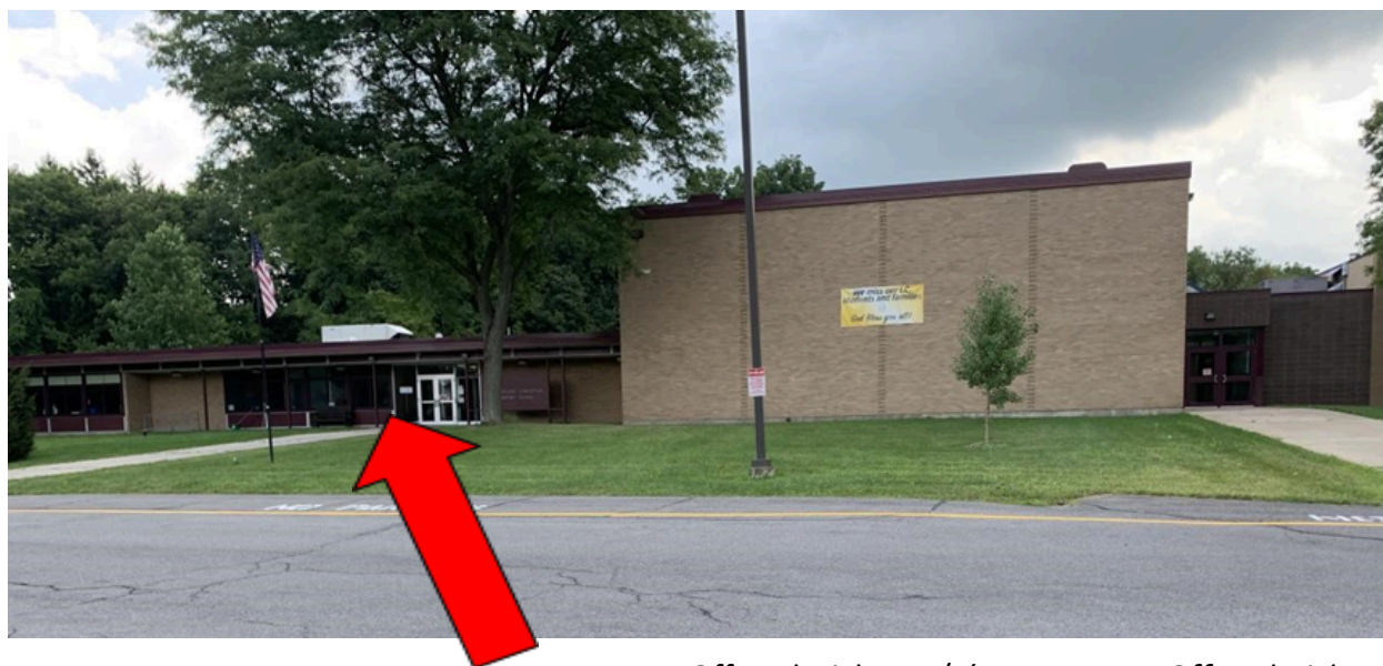
Front of School / Main Entrance

Bus Drop Off and Pick Up / (Parent Drop Off and Pick Up During School Hours)